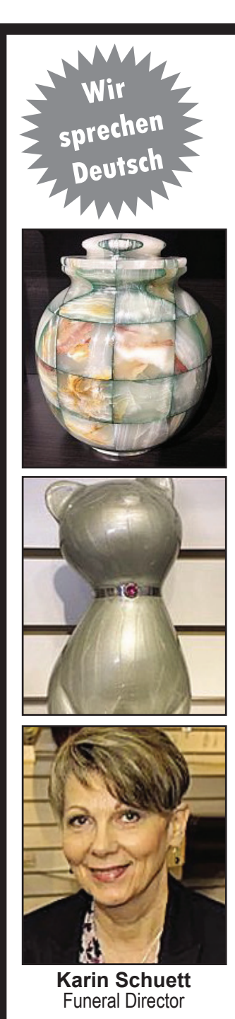
Circle of Life

Cremation and Burial Centre Inc. Independent, Family Owned & Operated