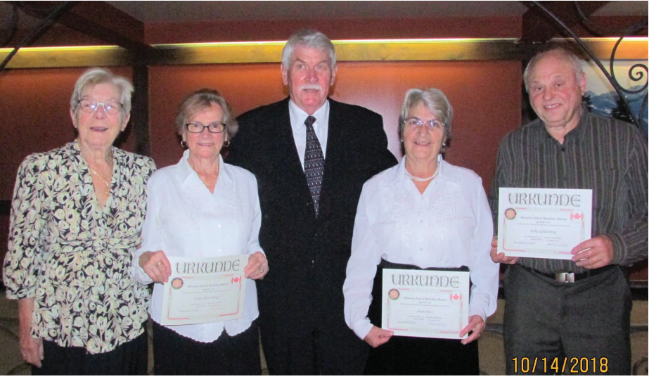
25 Year Members