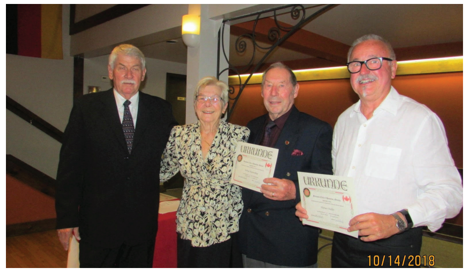
45 Year Members