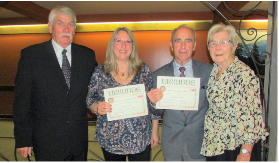
10 Year Members